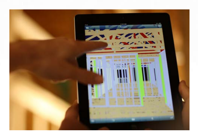
With SAPPHIRE Viewer problems can be prevented before the components are manufactured.

were on eFrame. After we decided to move to SAPPHIRE Structure , I put two designers on it early, so they'd set up Structure and learn it for when we all converted over. Those two designers worked out all the labeling defaults. They set up all the layout templates, the colors, the line thicknesses, and arrow sizes. That's the stuff you go deep into the SAPPHIRE Structure program to set up. Then, when they were done, we switched everyone over. So, right off the bat, we had these two guys in the office that already knew SAPPHIRE well. With those guys, and support from MiTek, which was always there, we had a smooth transition. Within two weeks, everyone was up to speed, or at least to where they were with eFrame. But there's lots more capability in SAPPHIRE over eFrame, and we've really expanded our knowledge since we changed."