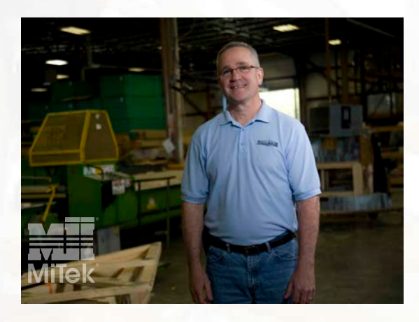
"For me, the number one reason for going over to SAPPHIRE Structure was to have access to SAPPHIRE Viewer.

SAPPHIRE Viewer™ is a free 3D software tool, designed for builders, architects, and engineers to collaborate with component manufacturers on house designs using a shared 3D model. With SAPPHIRE Viewer , users can quickly review SAPPHIRE models in "plan" and 3-D views, using zoom and pan. They can also access bookmarked views, elevation drawings and isolate items to view in the model, such as a particular level or layer.