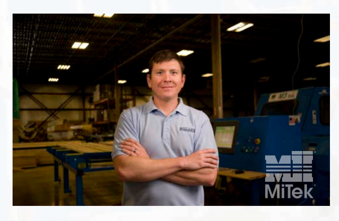
"There's lots more capability in SAPPHIRE over eFrame, and we've really expanded our knowledge since we changed."

"We actually had component designers with varying backgrounds and software expertise, "Nagel explains. "Some of them had been on TrussWall, and many more