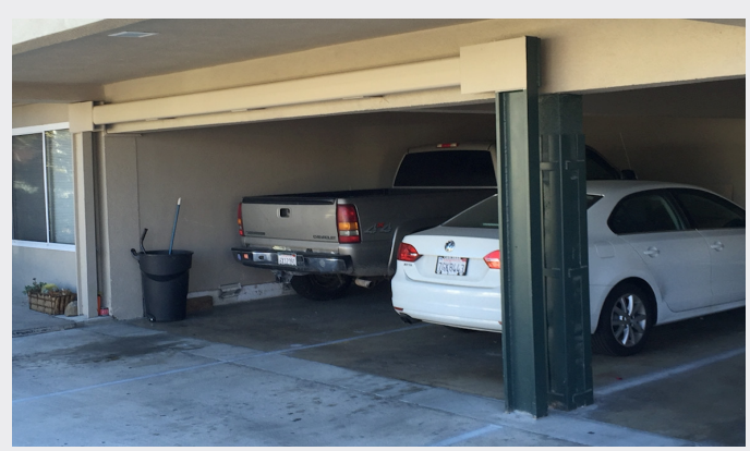
A Hardy Frame special moment frames was installed to protect this "soft story" garage opening. The special moment frame was painted to blend with the building.

"We decided to use the Hardy Frame SMF, because we are very familiar with the product, and we've found it's easy to install. Plus, the Hardy Frame SMF is the product that offered the least disruption to the tenants." - Morgan Jones, consulting engineer